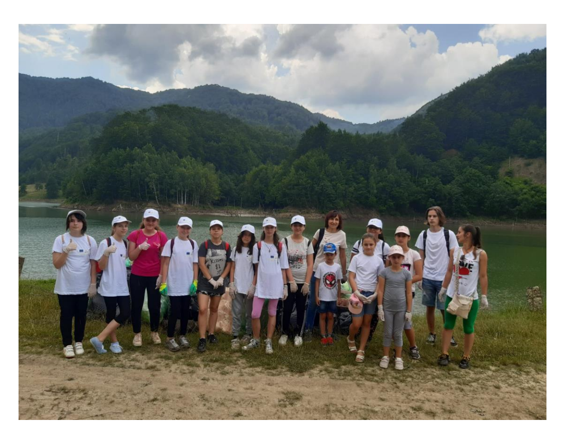
"Nicole Iorga" Nehoiu High School Volunteers collecting waste from the Siriu reservoir bank